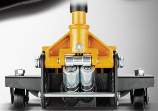
Dual Pump Fast Lift