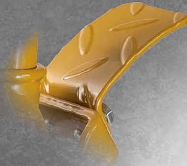
Foot Pedal Pump