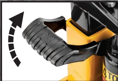
Integrated Patented Auto-Lock for Safety