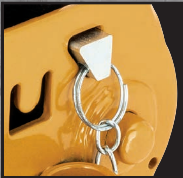
Double Locking Safety Pin