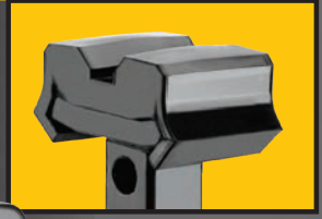
Pinch Weld Adapter Prevents Damage to Vehicle